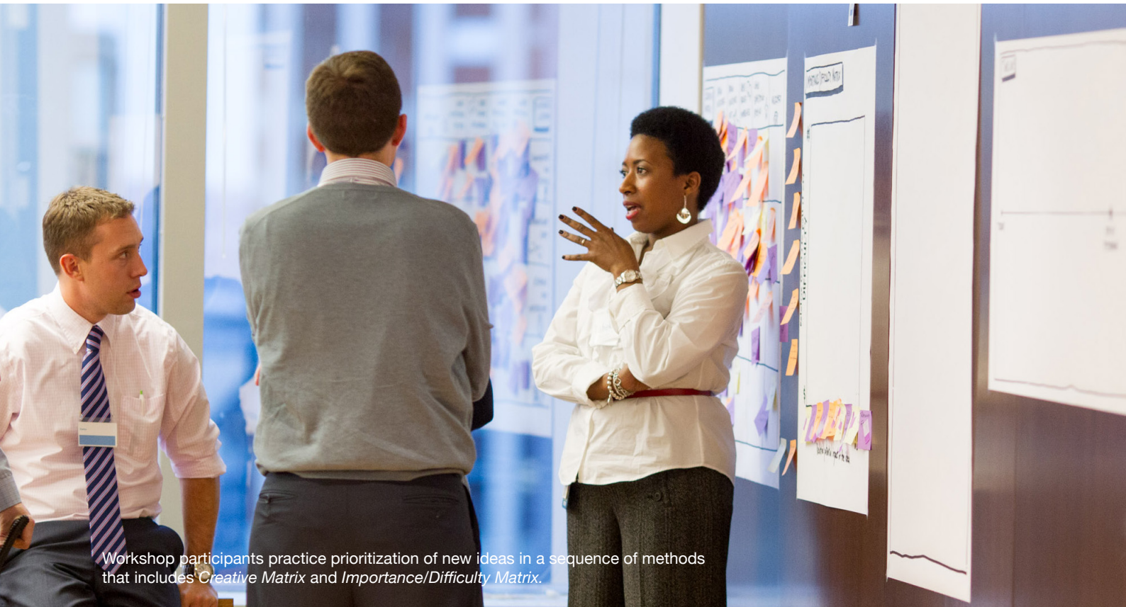
Workshop participants practice prioritization of new ideas in a sequence of methods that includes Creative Matrix and Importance/Difficulty Matrix .